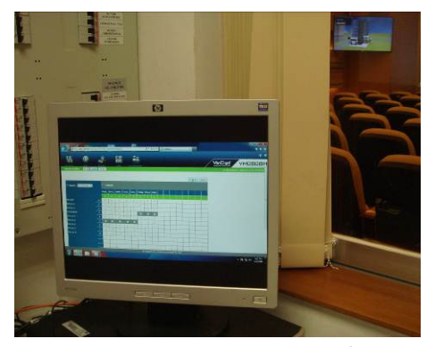
VM0808H Browser-based GUI for Flexible Remote Management