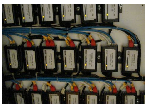
cable to extend the distance between source and display devices

"Since there are different video sources from various devices in our new A/V broadcasting system, the biggest challenge for us is how to manage varied signals inputs and outputs. ATEN's products can be compatible with most video devices on the market that provide stable and smooth video display performance. By integrated ATEN's HDMI Matrix Switch with Samsung's video wall system, our operators in the control room can easily control various signals via ATEN's unique GUI tool that can simplify the management processes. In addition, thanks for ATEN's high quality products and complete pre-sale and post-sale services that help us to choose the right products for our broadcasting system while saving time and cost on the system installation." – Customer Feedback