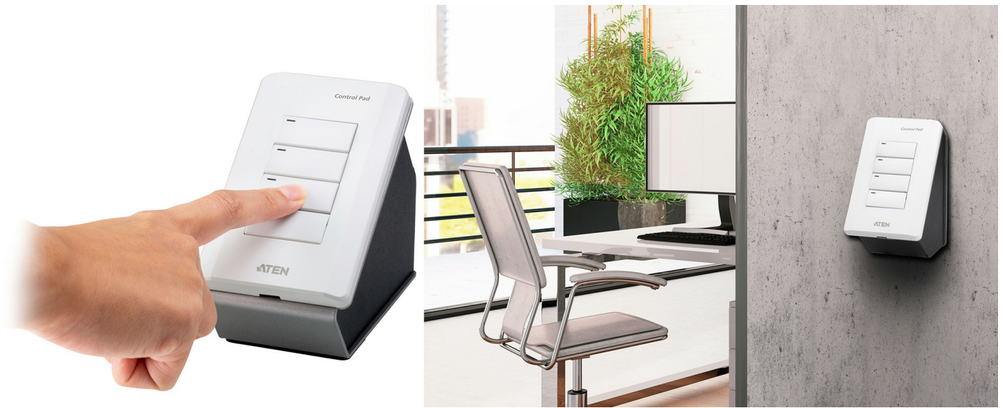
Enables flexible installation for either placement on the table or mounting on the wall