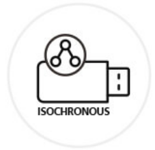
Isochronous USB Transfer