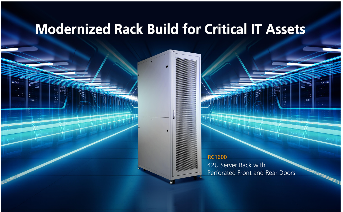
RC1600 42U Server Rack with Perforated Front and Rear Doors

Reputable for their sturdiness and reliability, ATEN racks are accredited with various certifications to demonstrate their reliability in securing critical IT equipment within data centers and server rooms. In addition to UL and CE certifications, ATEN racks are also EIA/ECA-310-E compliant.