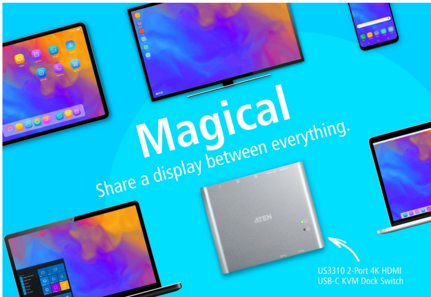
US3310 2-Port 4K HDMI USB-C KVM Dock Switch