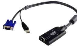
KA7170 USB KVM Adapter Cable

After careful evaluation, to allow IT administrators to perform remote server management securely, the Changwon City Government chose to install ATEN's KVM Over the NET™ Solution. The required installation included the KN2140v – 40-Port KVM Over the NET™ switch and the KA7170 – USB KVM Adapter Cables. The KN2140v supports 1 local and 2 remote users access to 40 servers, allowing remote management from the control room and various administrative computers. By connecting the Data Center servers to the KN2140v KVM Switch via USB KVM Adapter Cables, the Changwon City Government was able to effectively manage all 40 servers in the Data Center and fully satisfy their management requirements.