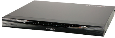
KN2140v 40-Port KVM Over the NET™

ATEN KVM Over the NET™ Solution provides local and remote management of the Data Center Servers with security controlled access