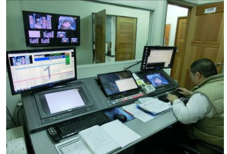
KM0932 allows 24-hour monitoring of video playback from the control room, and immediately activates the backup system when problem occurs.

Unlike previously used KVM switches, the ATEN Matrix KVM switch supports full audio transmission from all servers. When problems occur with the equipment, the administrator hears the alarm sound made by the server from the console speakers, so that problems can be monitored and fixed quickly, as they occur, lowering potential repair costs. The KM0932 also connects to the rack equipment in the control room that used for scheduling broadcasts, when any problem occurs they can immediately switch to backup systems using the KM0932, which assures continuous video playback without interruption.