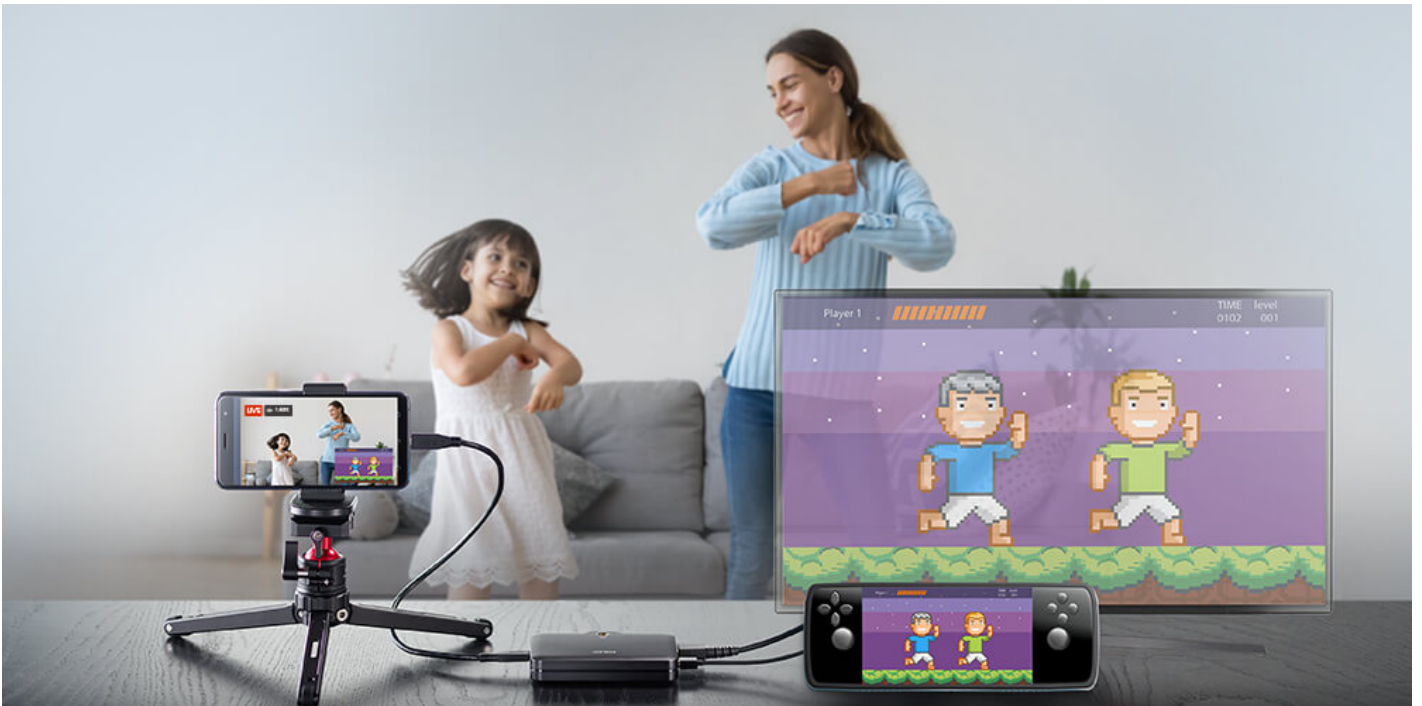
Game Capturing even for Party Games