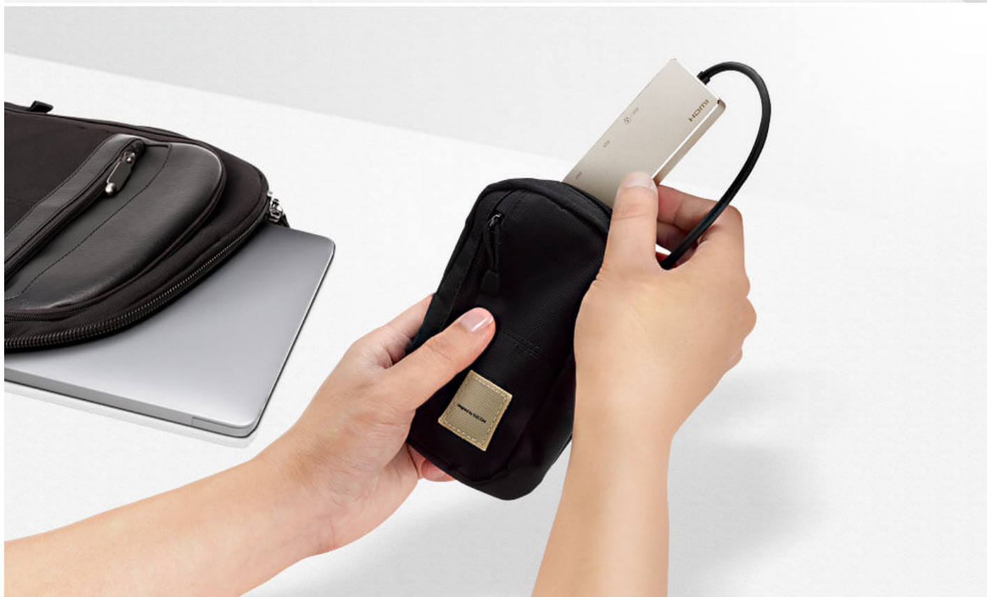
Lightweight, Compact Design with Ultra-Long USB-C Cable