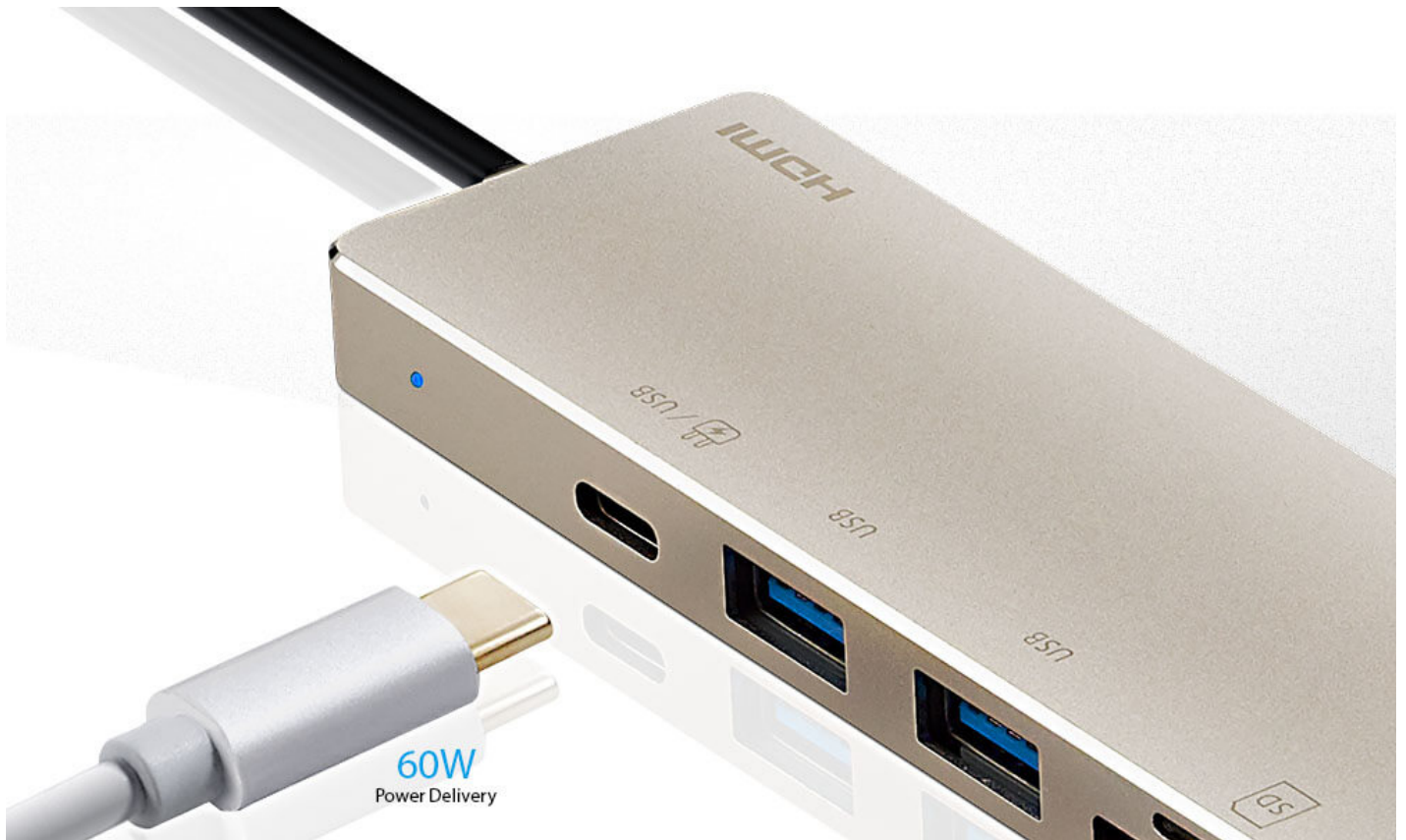
One Dock for Massive Expansion