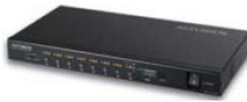
PN0108 8-port Power Over the NET™