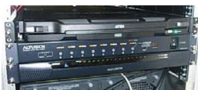
KN2116A, PN0108, CL5800 operate smoothly and each takes up just 1U of space

Since Yuzu TV adopted the ATEN solution, all operations can now be completed smoothly in an efficient infrastructure. Yuzu TV has connected the servers to the KN2116A KVM switch for the BIOS-level server