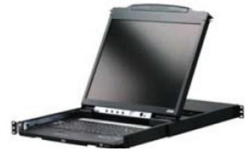
CL5800 Dual Rail LCD PS/2-USB Console

Yuzu TV looked at its parent company's infrastructure before deciding on the equipment to purchase. In order to access the server BIOS screen in the event of a malfunction, digital KVM equipment was a must. Mr. Miyamoto: "ATEN's KN2116 16-port KVM Over the NET™ had already been adopted by the parent company and has worked smoothly. ATEN was therefore strongly recommended. After careful evaluation and research, we decided to adopt ATEN's KVM Over the NET™ solution. This took the form of the KN2116A, a newer version of the KN2116, as well as the PN0108 Power over the NET currently used with the parent company. As the PN0108 and KN2116A are compatible with each other, they simplify the administrator's management of the KVM and power supply. The two devices work seamlessly together to provide a complete solution to our current dilemma."