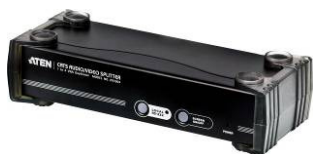
VS1504 4-Port Cat 5 Audio/ Video Splitter