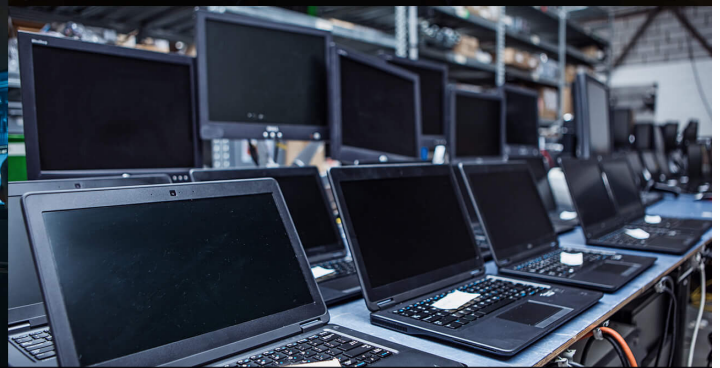
Equipment Testing Center