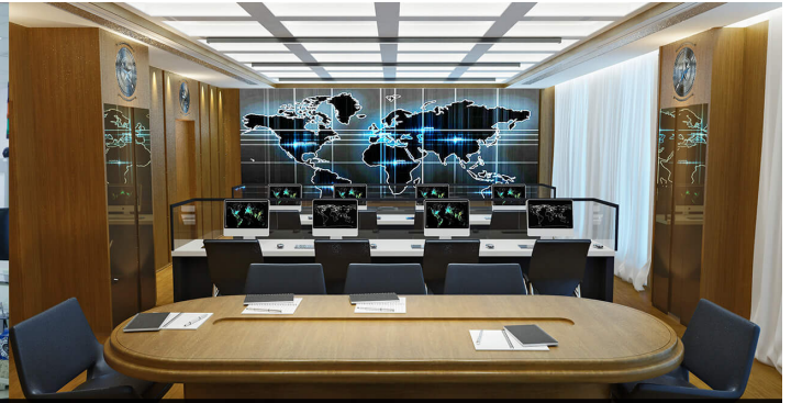
Meeting Room Control Center