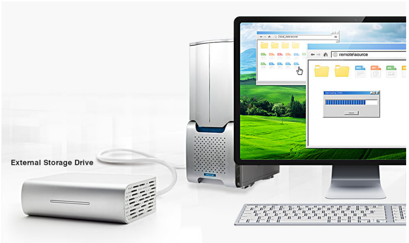
External Storage Drive