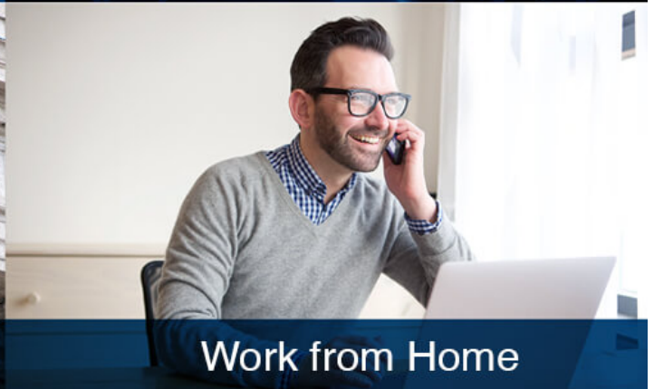
Work from Home