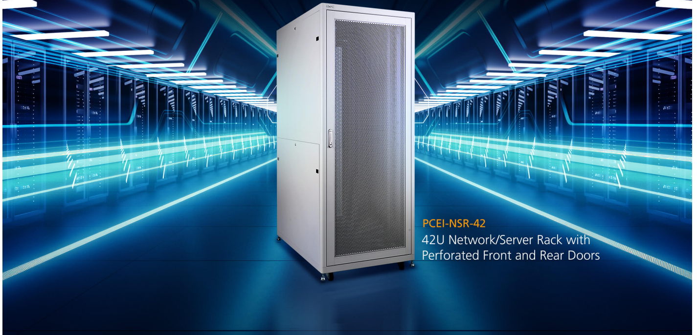
PCEI-NSR-42 42U Network/Server Rack with Perforated Front and Rear Doors

Reputable for their sturdiness and reliability, ATEN racks are accredited with various certifications to demonstrate their reliability in securing critical IT equipment within data centers and server rooms. In addition to UL and CE certifications, ATEN racks are also EIA/ECA-310-E compliant.