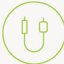
Plug and Play