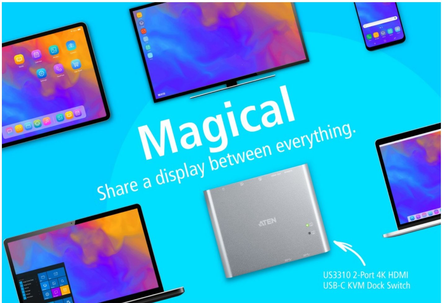
US3310 2-Port 4K HDMI USB-C KVM Dock Switch