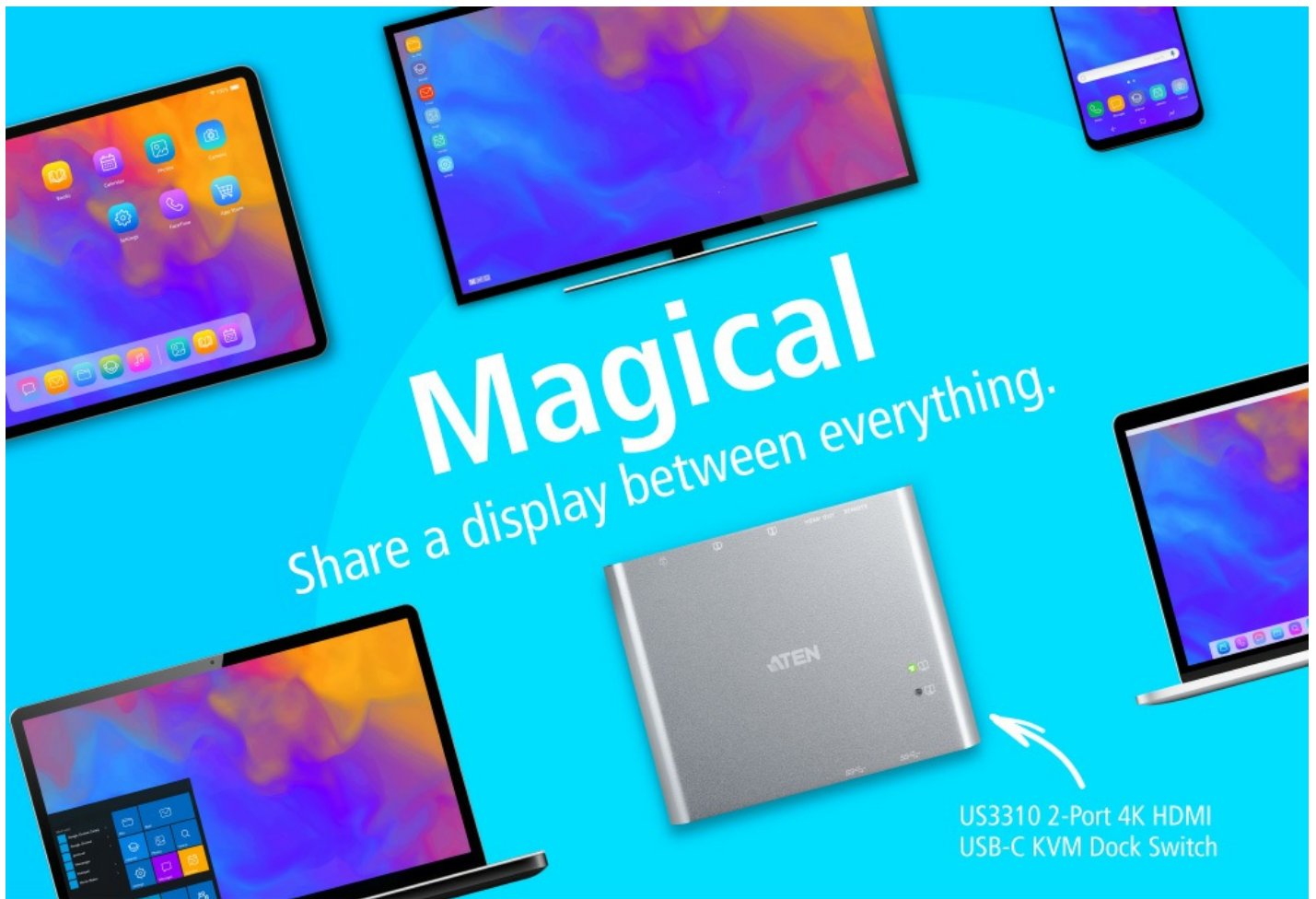
US3310 2-Port 4K HDMI USB-C KVM Dock Switch