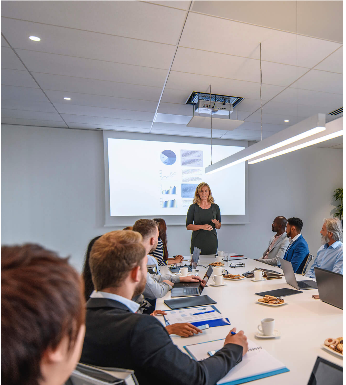
Meeting Room / Office