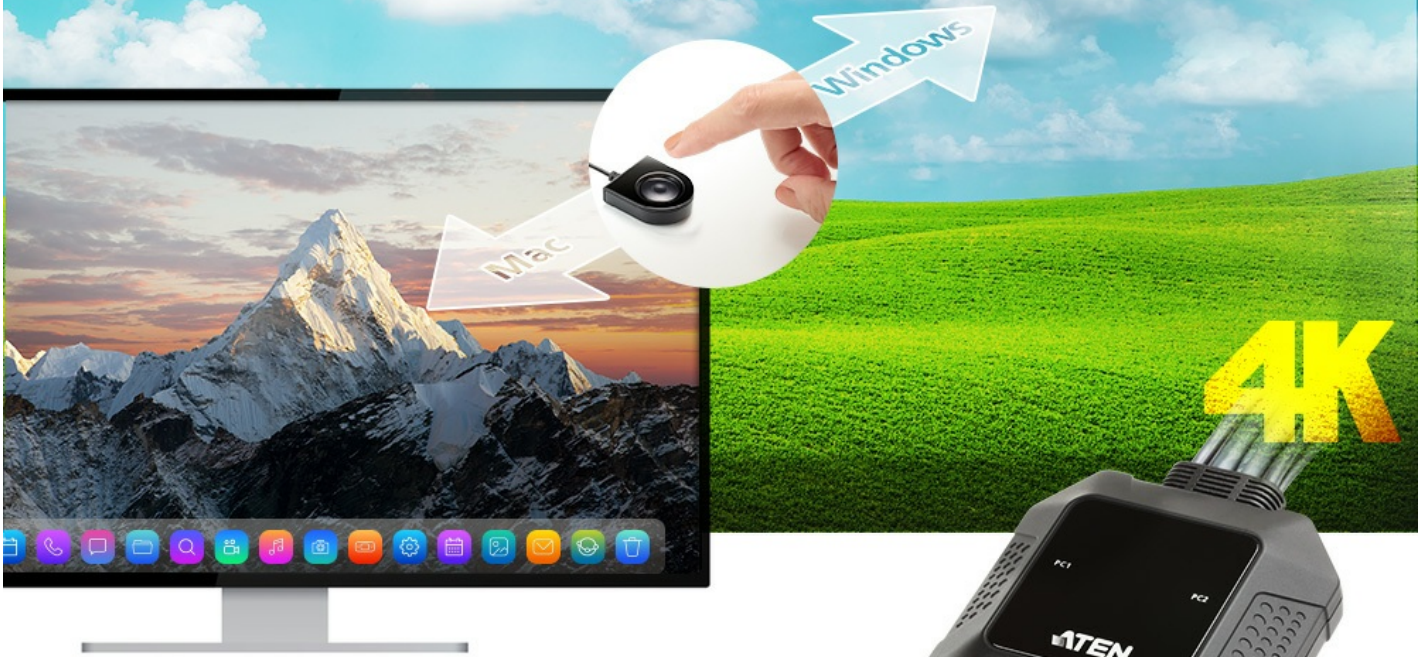
CS22DP 2-Port USB DisplayPort Cable KVM Switch with Remote Port Selector

Having two computers running different projects at the same time can be a time saver, but having a KVM console set up to switch between computers via a pushbutton over one shared screen makes multitasking even more productive. Allow the CS22DP compact cable KVM switch to work its magic by de-cluttering your desktop workspace with a neat and space-efficient new look, and further enrich your operations with superb 4K audiovisual quality, making your desktop workflows more enjoyable.