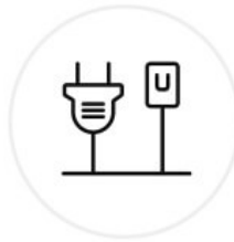
Network / Power Redundancy