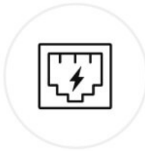
10 Gbps Network