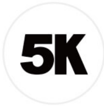
Exceptional Visual Quality