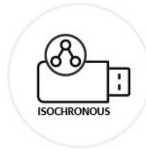
Isochronous USB Transfer