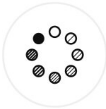
12-bit Deep Color